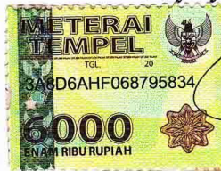
Gina Felandri 15019007/2015