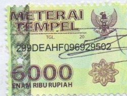
Esron Simarmata 15019045/2015