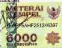
Arnold Setiawan 15019003/2015