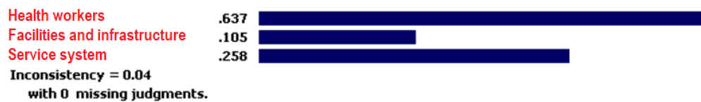
Fig. 2. Weight of Interest Between Criteria and Consistency Policy

Goal: Feasibility of Puskesmas based on Dempo Volcano Eruption Disaster Mitigation