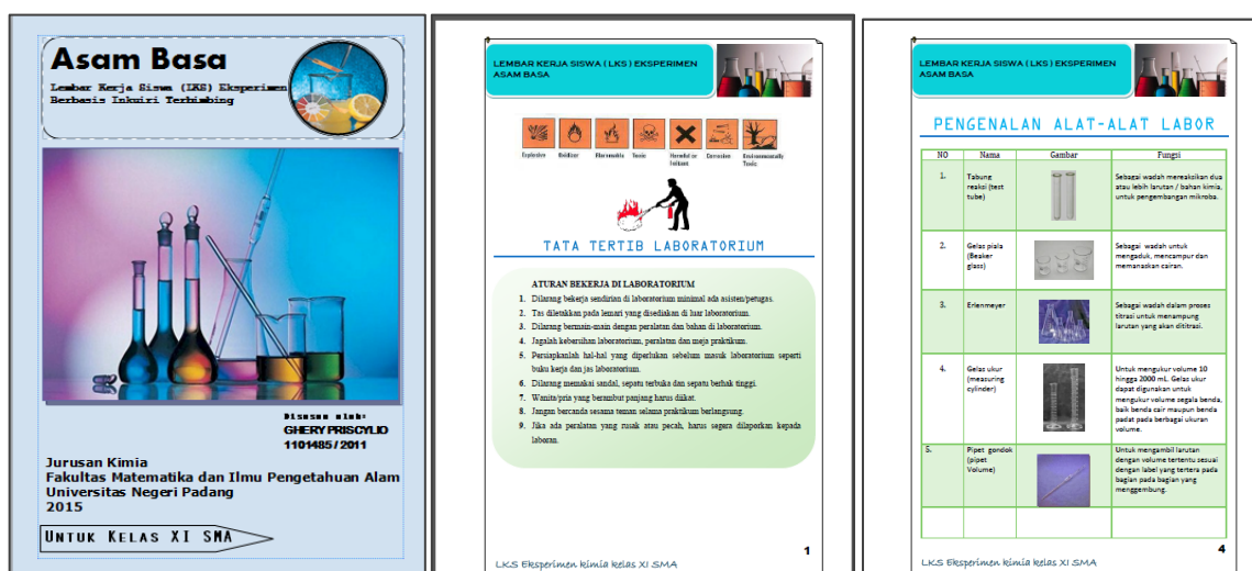
Figure 2. Display of developed guided inquiry experiment student worksheet.

This is the display of developed experiment worksheets based on guided inquiry on the topic acid and base in Figure 2. We can see that the experiment worksheets was colourful. This experiment worksheets equipped with introduction of laboratory equipment and laboratory rules, introduction of laboratory equipment, teacher instructions and student instructions.