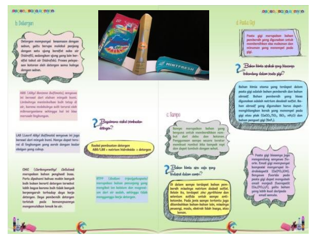
Figure 6. Draft of Pop-Up Book Content on page 5 and page 6