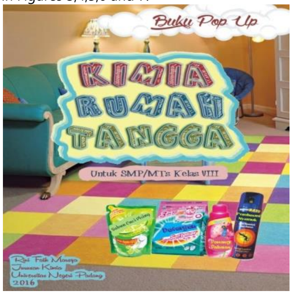
Figure 3. Draft of Pop-up Book Cover

The display of the pop-up book teaching material that has been developed can be seen in Figures 3,4,5,6 and 7.