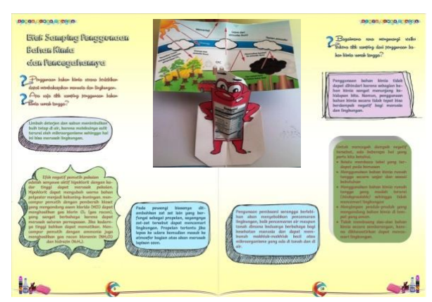
Figure 7. Draft of Pop-up Book Content on page 9 and page 10