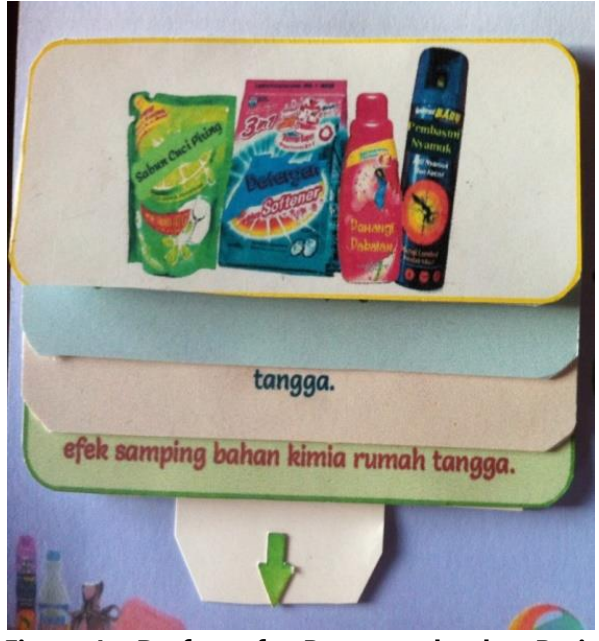
Figure 4. Draft of Pop-up book Basic Competencies