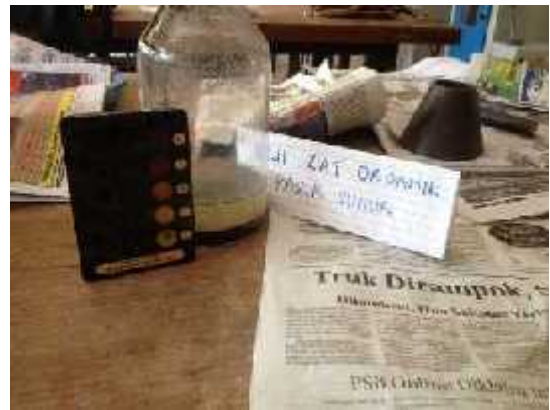
Figure 2. Organic Sand Sunua