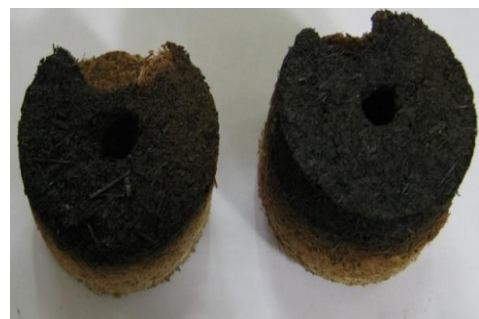
Prototype of Sugarcane Briquette Products Type II (Black/Charcoal briquet)