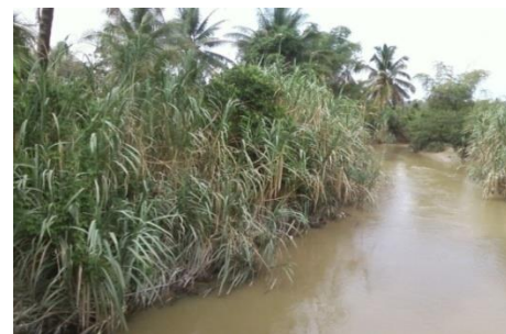
(b) Tibarau/wild sugarcane