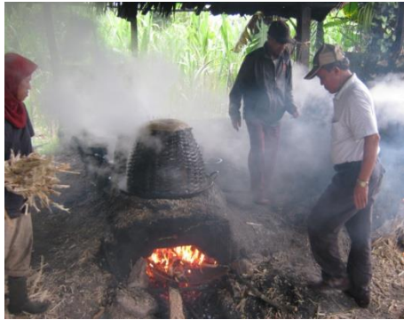
(a) Process of production Saka