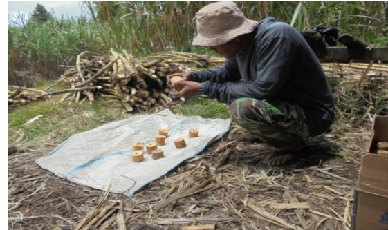
Figure 7. Trainee are Drying of Baggase Briquettes as a Result of his work

Sooth their works have established a significant learning experience against the results acquired, where among other things seen from a few examples of the results of their work (product of fuel briquettes) after carrying out the work/training as shown in Figure 7.