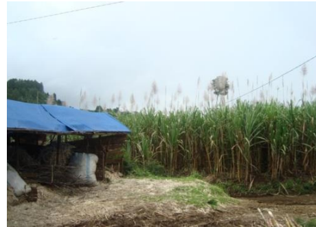
(a) the Sugarcane

The characteristics and scale of the effort smaller sugar saka industry, have been found [4] form are on condition of increasing return to scale at which level it is still beneficial to prospective and continue to be developed, including an expansion of efforts (diversification) or the addition of new products. A potential source of raw material for the development of abundant enough, and made from sugarcane ( saccharum officinarum ) and/or plant Tibarau or wild sugarcane ( saccharum spontaneum Linn) as raw material substitution such as seen in Fig 4.