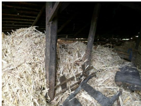
(b) Raw material of bagasse