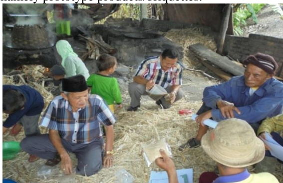
Figure 6. The situation mood of the Participant on the moment of Training Process

Based on the results of interviews with participants/craftsmen, generally they posited can quickly understand training materials on how technical workmanship/manufacture of fuel briquettes. This is according to those affected by the presence of an existing example of assistance namely prototype products/briquettes.