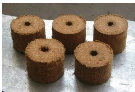
Prototype of Sugarcane Briquette Products Type I (Biobriquet)